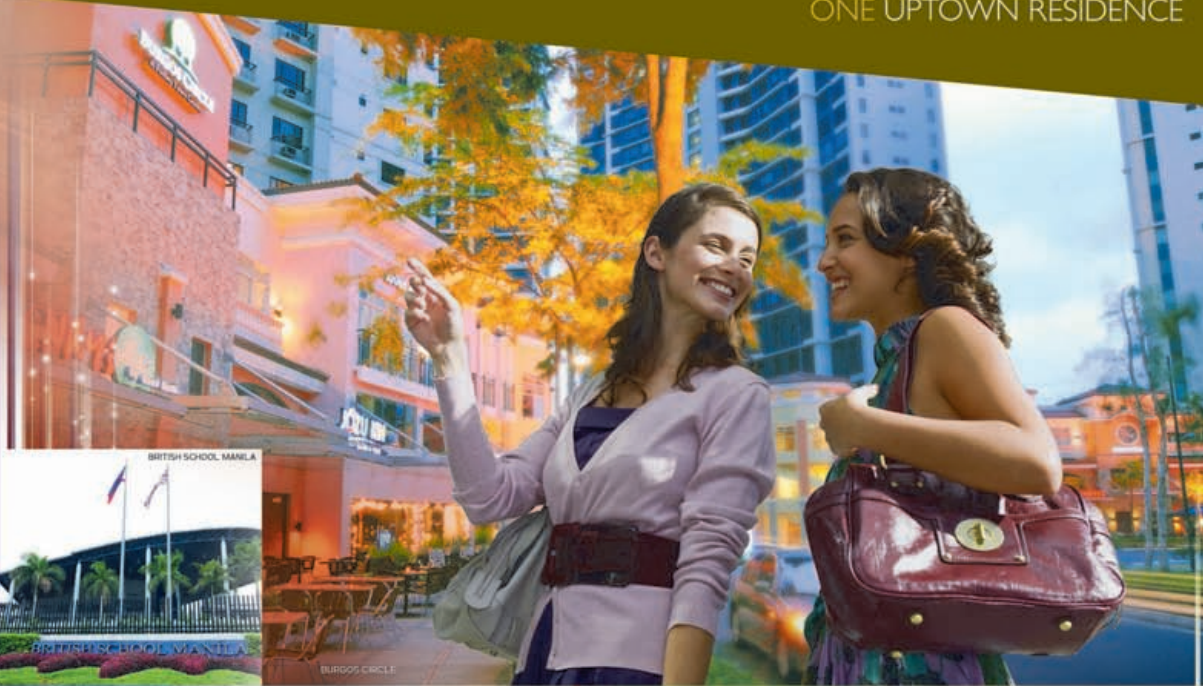
BRITISH SCHOOL MANILA