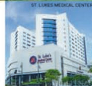
ST. LUKE'S MEDICAL CENTER

One Uptown is your gateway to the best of nearby Global City. Be minutes away from the British, American and Japanese international schools. Retail hubs such as Burgos Circle and Bonifacio High Street. And a wealth of urban conveniences including St. Luke's Medical Center, S&R and MC Home Depot. What's more, you're just a leisurely drive away from McKinley Hill's very own cyber park and Venice Piazza.