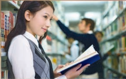
INTERNATIONAL SCHOOL MANILA