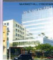
McKINLEY HILL CYBERPARK