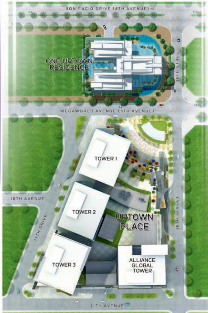
ONE UPTOWN RESIDENCE SITE DEVELOPMENT PLAN