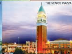
THE VENICE PIAZZA