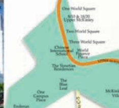
McKINLEY HILL VILLAGE